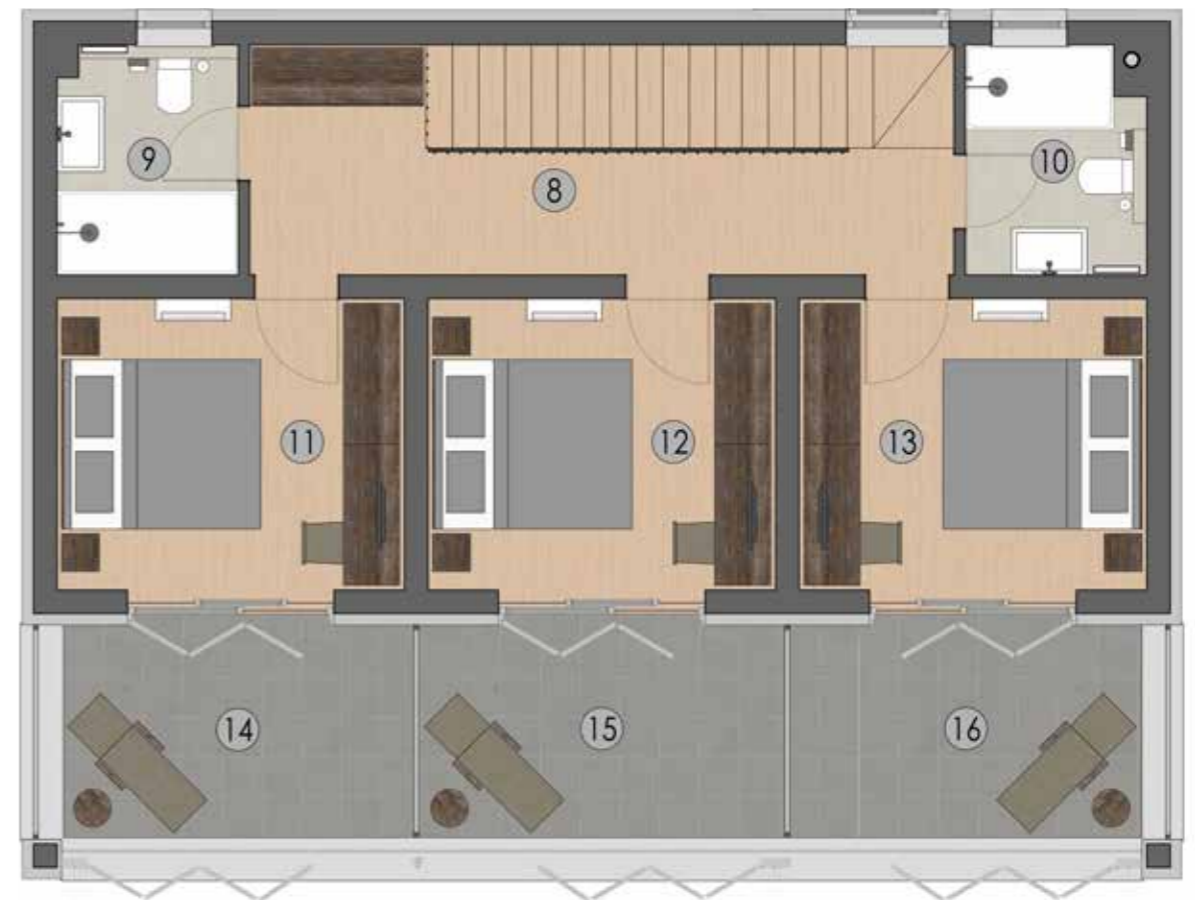
1 st floor plan